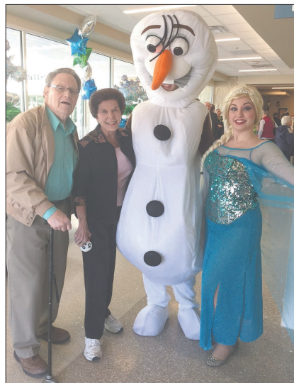
Texas Health Resources opened its new facility in Willow Park Monday, Jan. 19, preceded by a community event Saturday, Jan. 17 with a "Frozen" theme from the popular Disney movie.